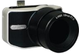
19 mm Default