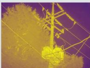
Image from the THERMAL EXPERT™

SEE THE NEW WORLD THROUGH i3system, Inc.