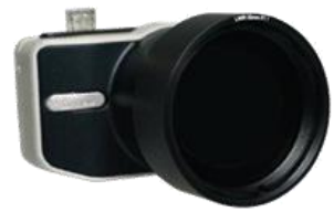
35 mm Optional