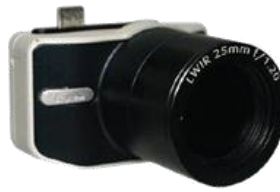
25 mm Optional