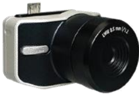
8.5 mm Optional

Mobile Infrared Camera (TE-V1) VGA 640 x 480, 17 \mu m pitch